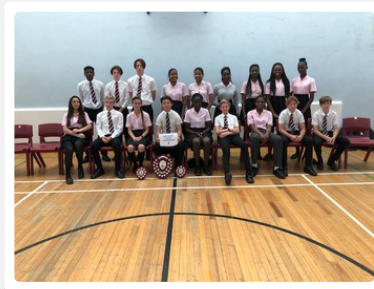
Year 9 Winners