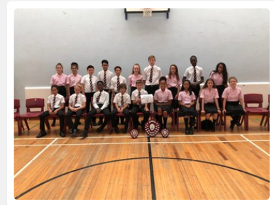
Year 7 Runners Up